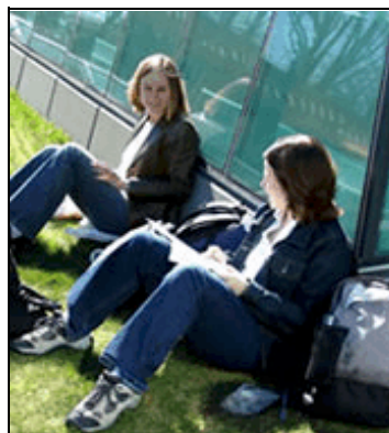
Students at UWashington School of Law, 2004